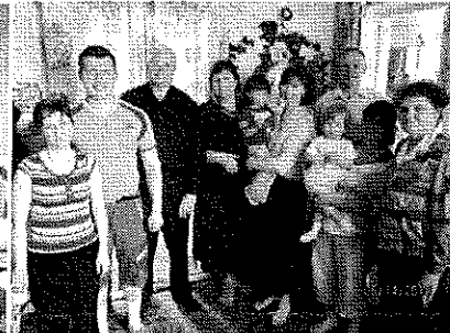
Krasnyi Laman Bible Class