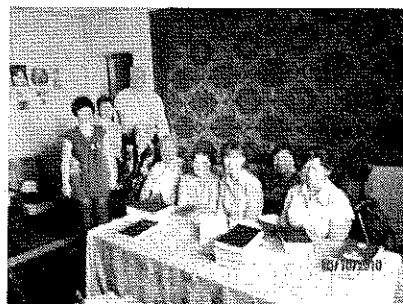
Krasnyi Laman Bible Class